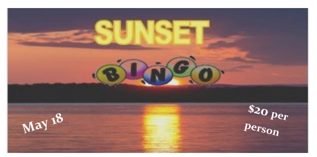
To Benefit the Haven of Lake & Sumter Counties Tickets on Sale at the May Meeting See Page 3 for details

The General Federation of Women's Clubs is a nonprofit organization that brings together local women's clubs in a collective effort to strengthen communities and enhance the lives of others through volunteer service.