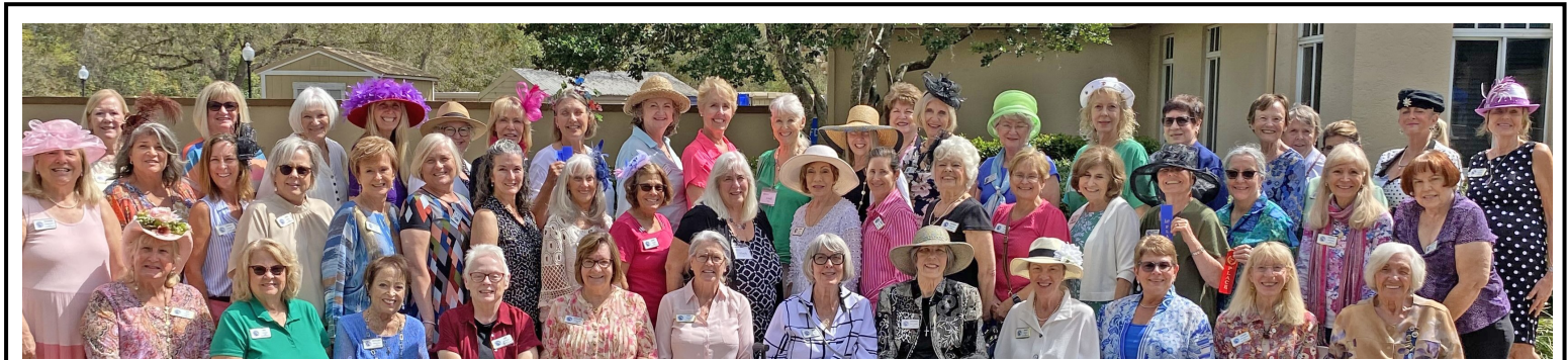
GFWC Mount Dora Woman's Club members and guests - March 2026 meeting