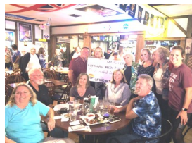
First Place Team "The Ballers"