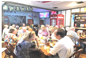
A Full House it was!!